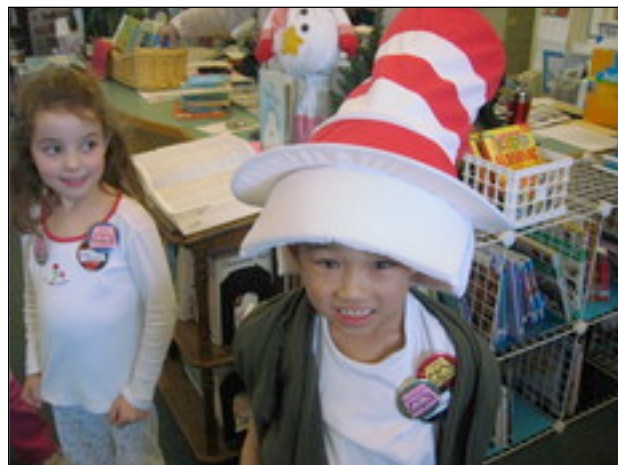
Students get into character for Dr. Seuss's Birthday Bash.